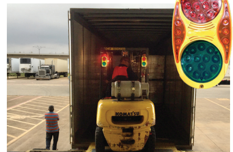
i-stop is needed to prevent accident like this one